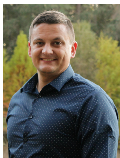
CARSON BAY Religion