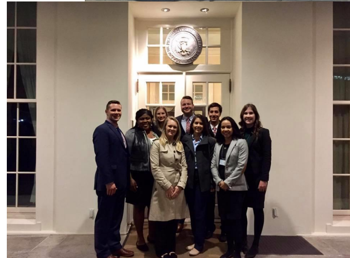
Class XI (above) at the U.S. Supreme Court and Class XII (below) at the West Wing of the White House