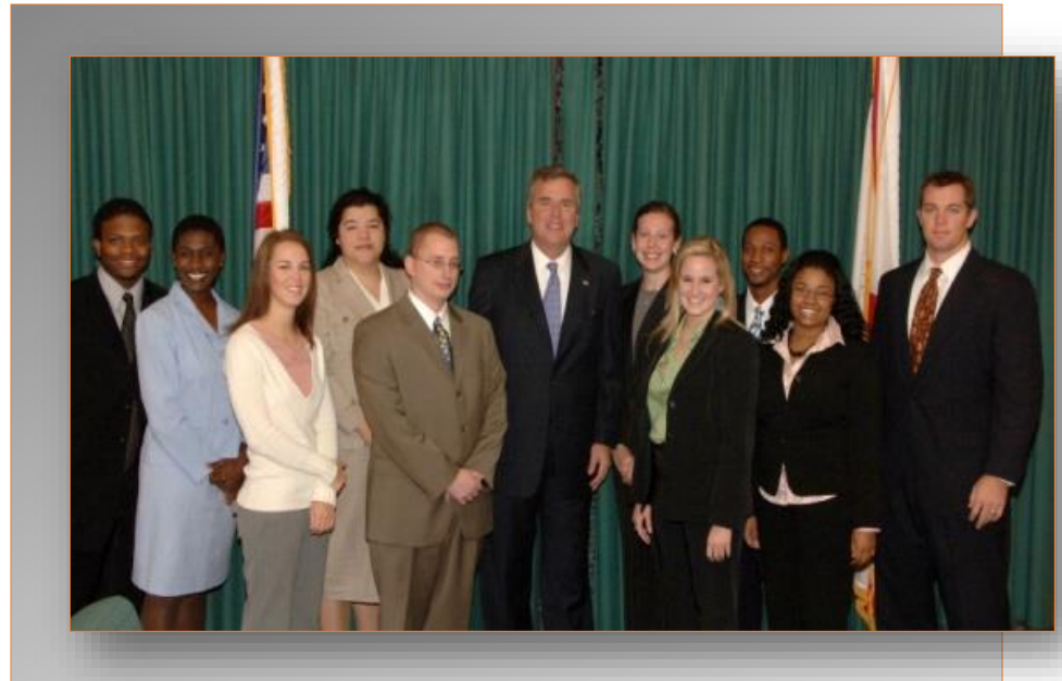
2007-2008 Class of Fellows meet with Governor Bush

Created in 2004 by Governor Jeb Bush to provide the next generation of leaders with first-hand, senior-level exposure to the workings of state government and to expand their commitment to public service.