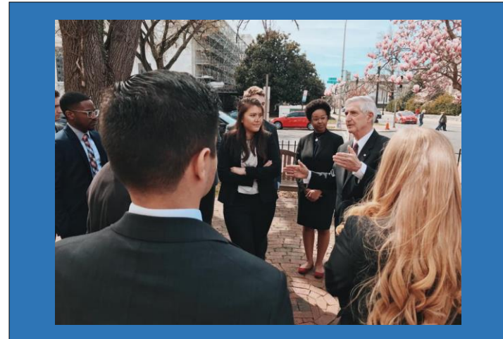
Class XIV Fellows meet with former Chief of Staff to President George W. Bush – Secretary Andy Card – at the Florida House in Washington, DC.