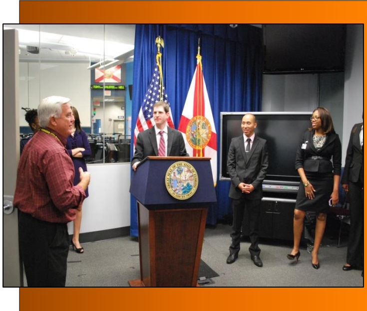
Members of 2012-2013 Fellows class at the State Emergency Operations Center

Fellows are placed in the Executive Office of the Governor or one of the Governor's agencies.