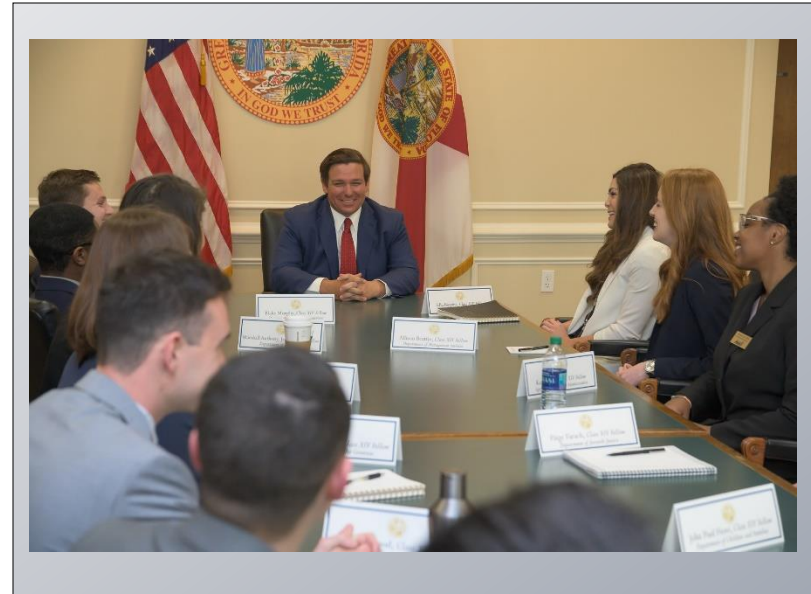
Members of 2009-2010 Fellows class at the State Emergency Operations Center